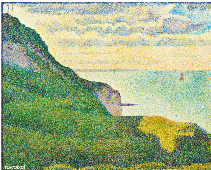
Georges Seurat, Seascape at Pt-en-Bessin, Normandy , 1888. Original from The National Gallery of Art

Some artists that are known for their pointillism paintings are : Georges Seurat, Camille Pissarro, Henri Matisse, Paul Signac and Vincent Van Gogh to name just a few.