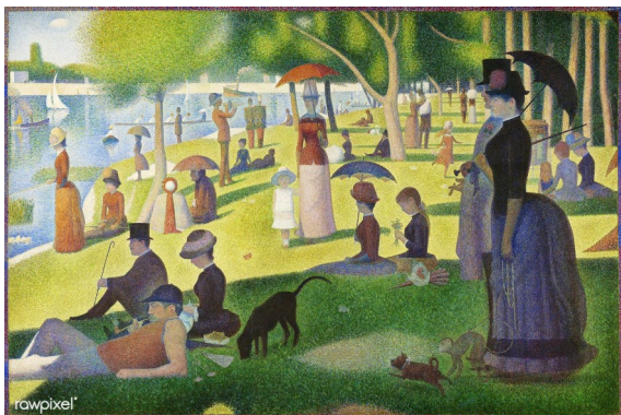
Georges Seurat, A Sunday on La Grande Jatte , 1884. Original from The Art Institute of Chicago.