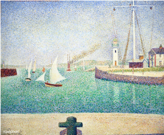
Georges Seurat, Entrance or The Port of Honfleur (Entrée du port d'Honfleur) , 1886.

Create a small picture of a boat using dots